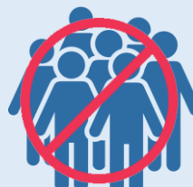
Avoid Crowded Places