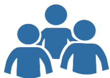
Person to Person