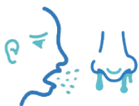
Inhaled Droplets from Coughing & Sneezing