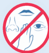
Avoid Touching your Eyes Nose or Mouth