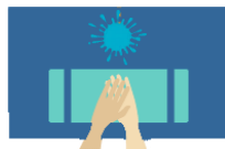
Droplets on Hands & Surface