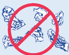
Avoid reuse of tissues