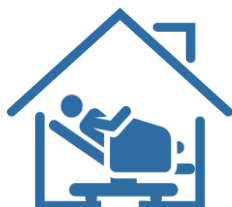
Isolation of Cases