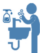
Wash Your Hands regularly With Soap & Water