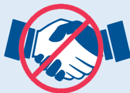
Avoid Shaking Hands